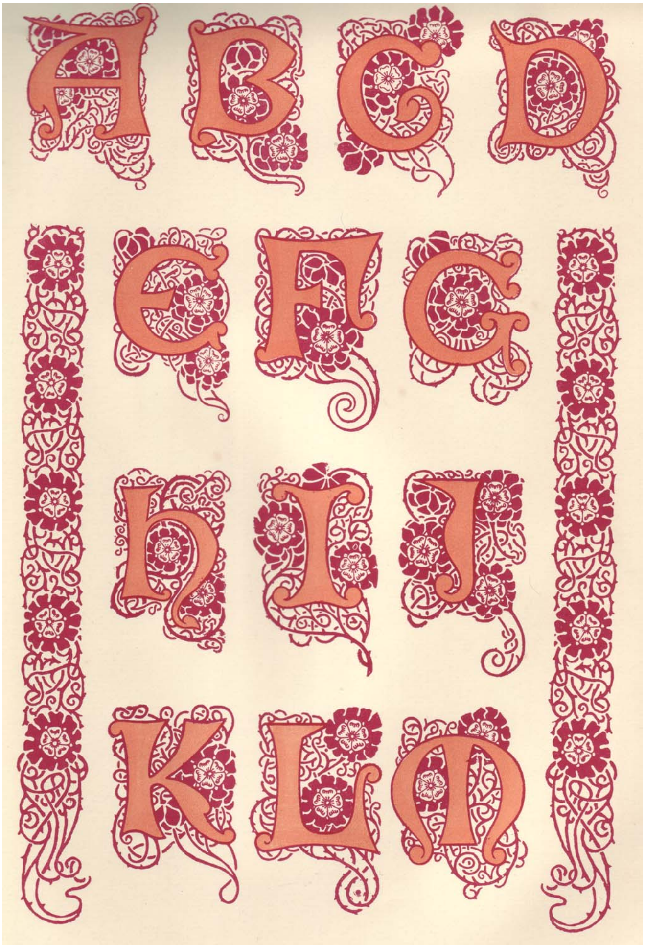
The Grange Series